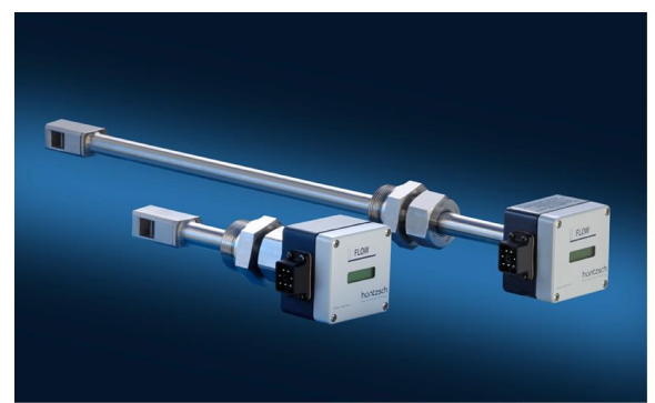
VA40 ... ZG7