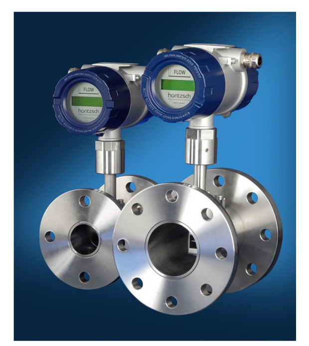
VA DI ... ZG1 Ex-d