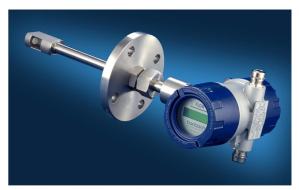
VA40 ... ZG8 Ex-d