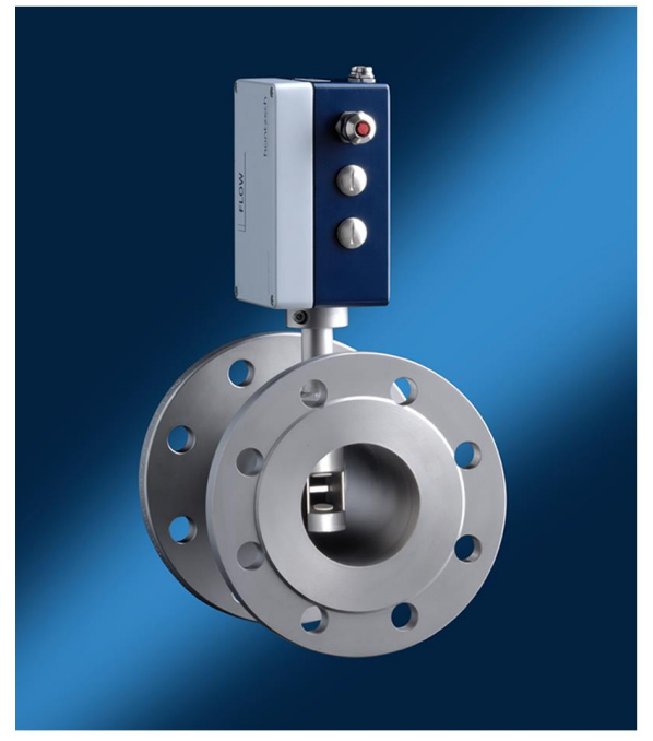
VA DI ... ZG1