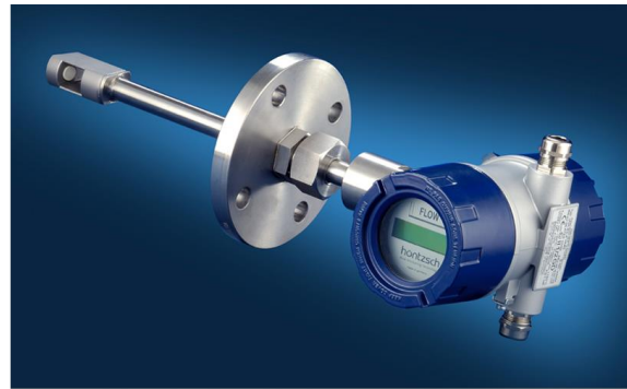
VA40 ... ZG8 Ex-d + VA40 ... ZG9 Ex-d