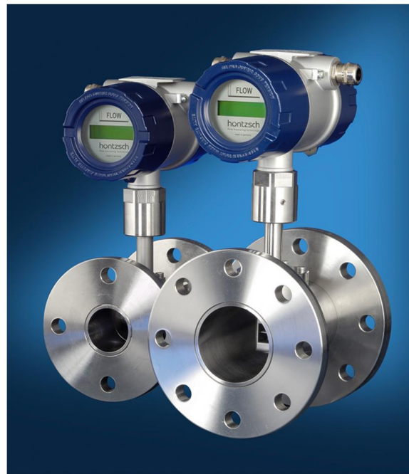
VA Di ... ZG1 Ex-d

* Principle design identical to VA40 ... ZG7