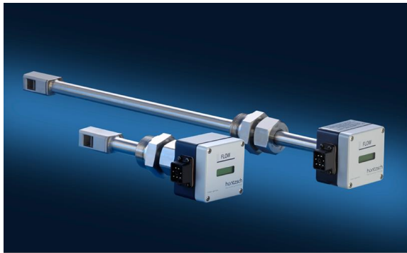
VA40 ... ZG7 + VA40 ... ZG10 (PVDF)