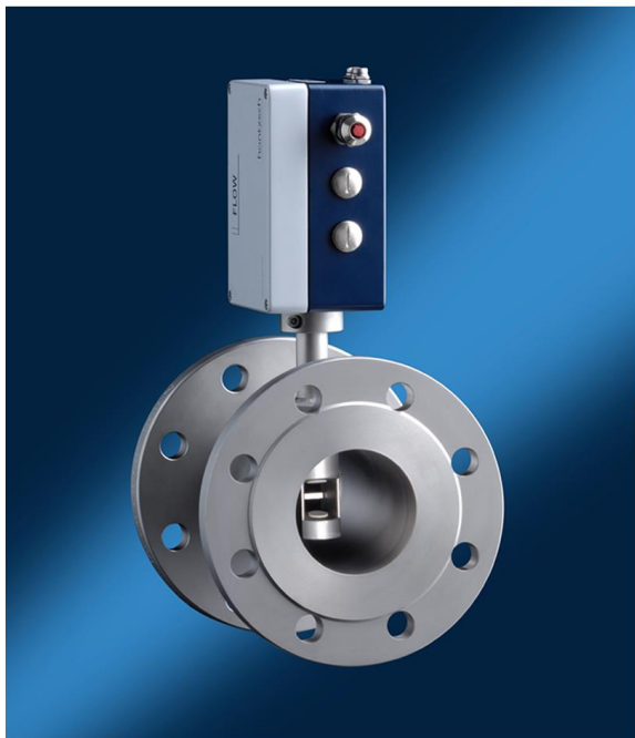
VA Di ... ZG1 + VA Di ... ZG2