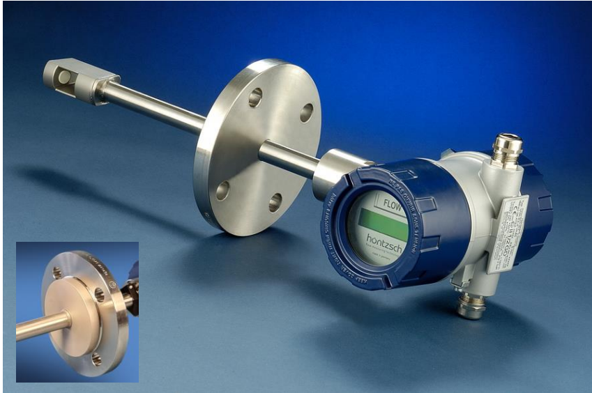
Probe VA40 according Drawing 9 with welded and lapped flange fixation

Vortex flow sensor VA40 ... ZG9 Ex-d with integrated, configurable transducer UVA in a flameproof enclosure for applications in explosive atmospheres