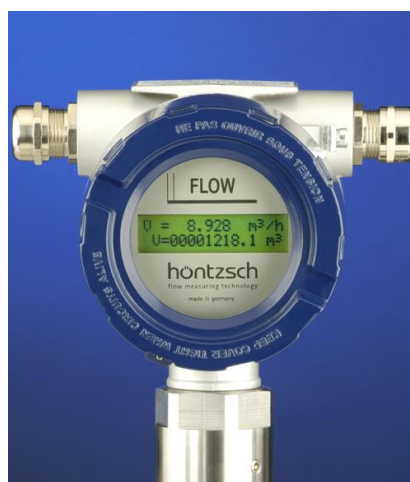
Ex-d transducer housing with optional LCD display

Höntzsch GmbH & Co. KG Gottlieb-Daimler-Straße 37 D-71334 Waiblingen Telephone +49 7151 / 17 16-0 E-Mail info@hoentzsch.com Internet www.hoentzsch.com