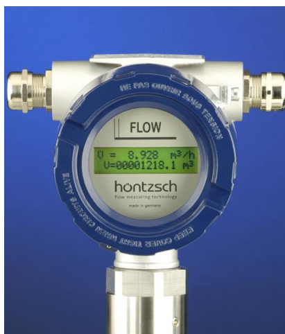
Ex-d transducer housing with optional LCD display