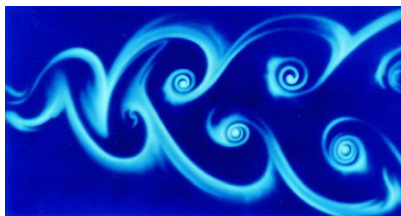
Kármán vortex street